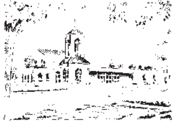
Our Lady of the Lake 129 Metro Road North, Keswick, ON L4P 3C8 Office: 905-476-0097 Fax: 905-476-0897