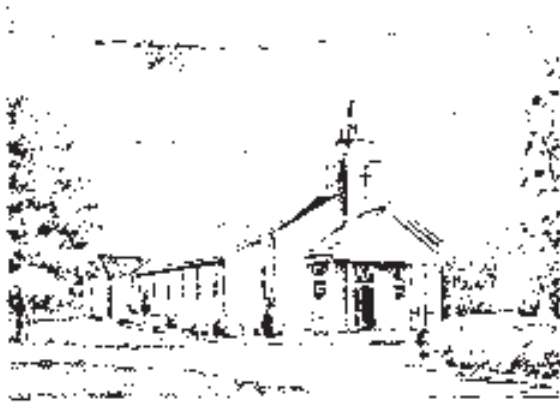
Immaculate Conception 20916 Dalton Road, Box 128, Sutton West, ON L0E 1R0 parish@immaculateconception.on.ca